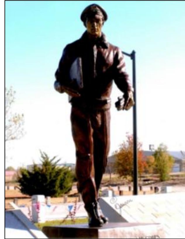
Stands approximately 6' tall on a 2' pedestal , overall height 8'